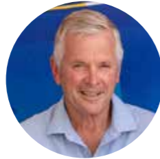
Cr Tony Rayner Mayor, Longreach Regional Council