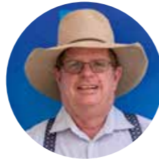
Cr Rick Britton Mayor, Boulia Shire Council