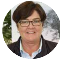
Cr Sally O'Neil Mayor, Barcoo Shire Council