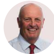
Cr Andrew Martin Mayor, Blackall-Tambo Regional Council